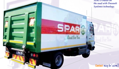
SERCO trailer on the road with Dassault Systèmes technology.