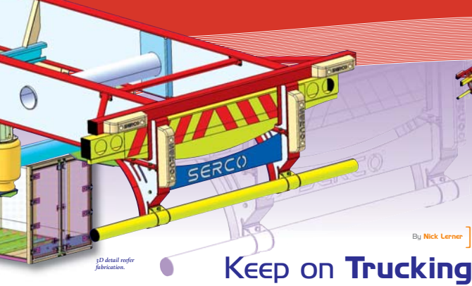
3D detail reffer fabrication.