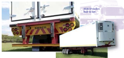
SERCO reefers built to last.

For more information: www.serco.co.za www.cdca.co.za